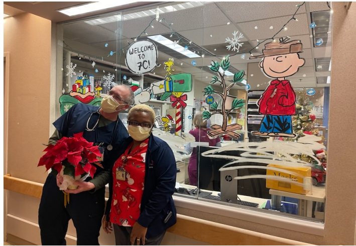
Featuring Michigan Medicine Staff